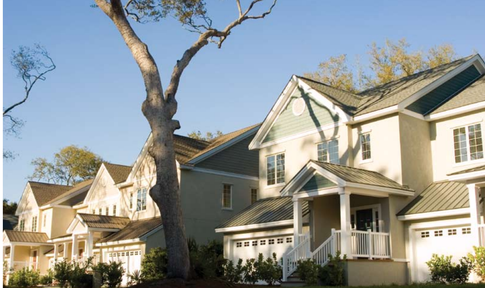
Investors and residence alike continue to relocate to St. Simons for a relaxed island lifestyle. Nestled among the magnificent oaks of coastal Georgia, Limeburn Village at Hampton Plantation introduces "Island Living" at it's best.

Only 57 of these stylish residences are being built and they are quickly becoming the most sought after real estate on the island.